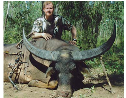
Little's water buffalo