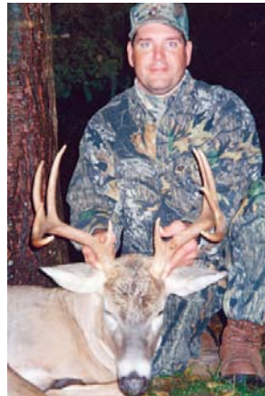
Miller's northern whitetail