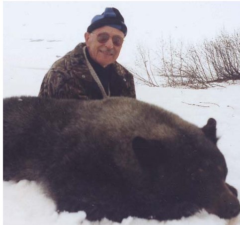
Cavallaro's glacier blue bear

Hunt date: Late October, early November 2004